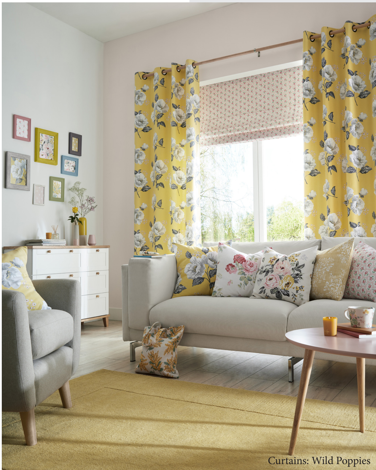
Curtains: Wild Poppies