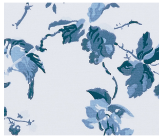
Birds and Roses