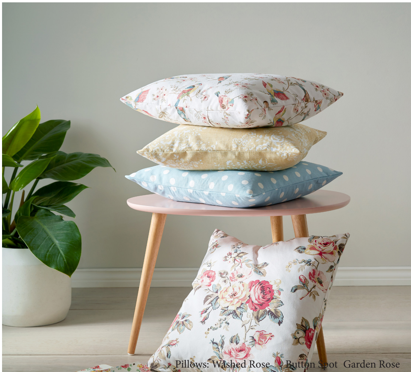
Pillows: Washed Rose Button Spot Garden Rose