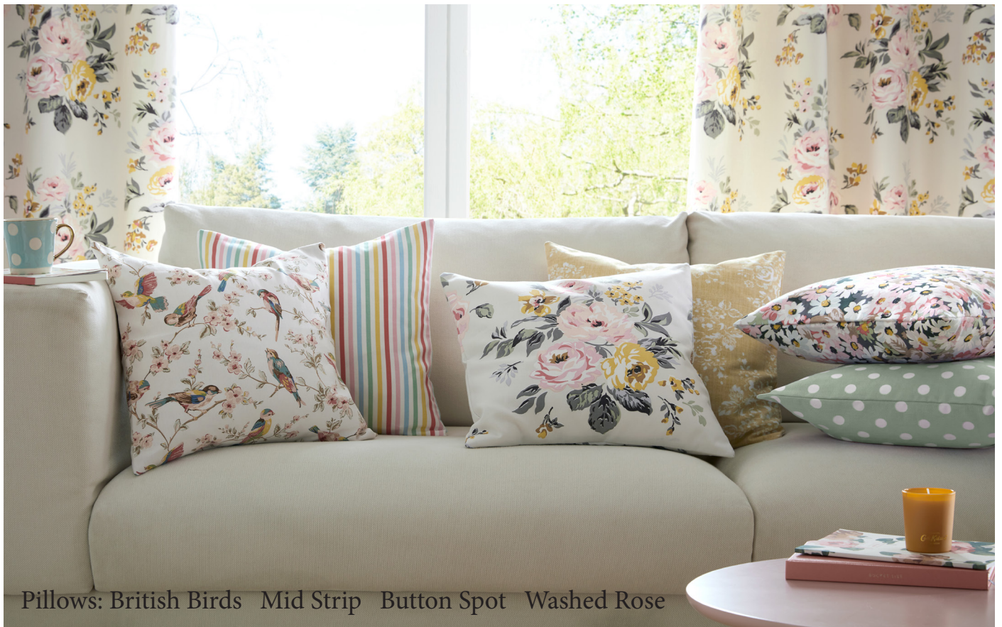
Pillows: British Birds Mid Strip Button Spot Washed Rose