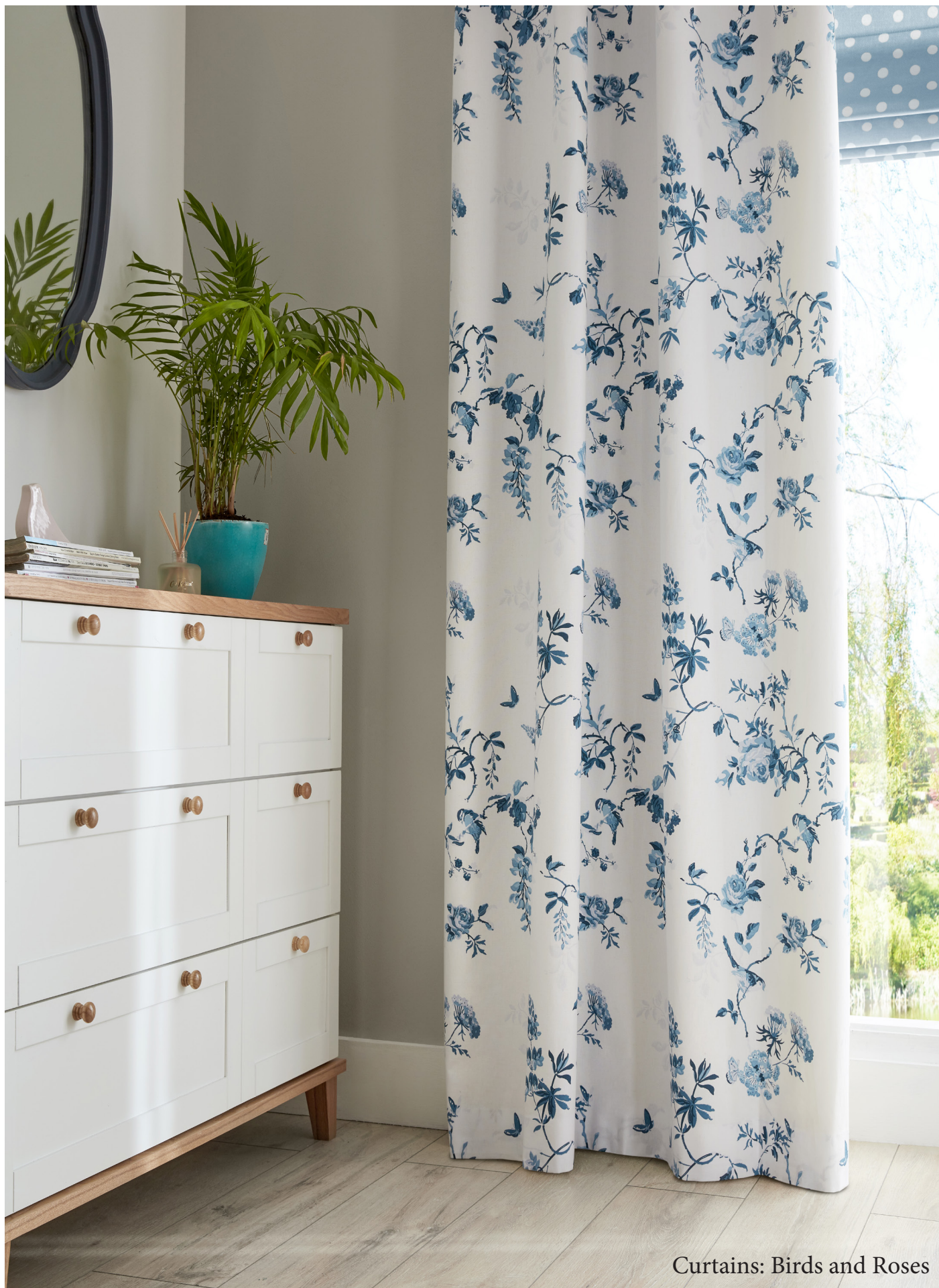
Curtains: Birds and Roses