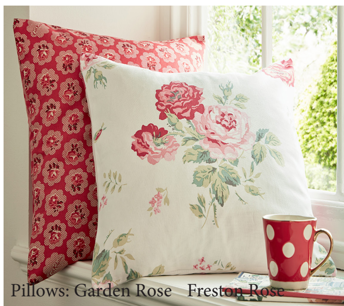
Pillows: Garden Rose Freston Rose