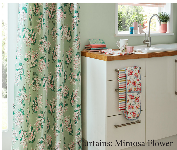
Curtains: Mimosa Flower